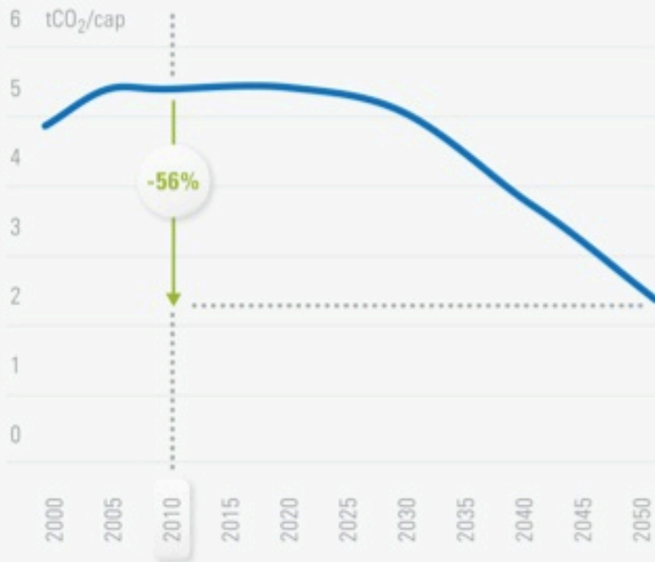
Figure 6.4. Average energy-related CO 2 emissions per capita, historical and DDPs for 15 countries