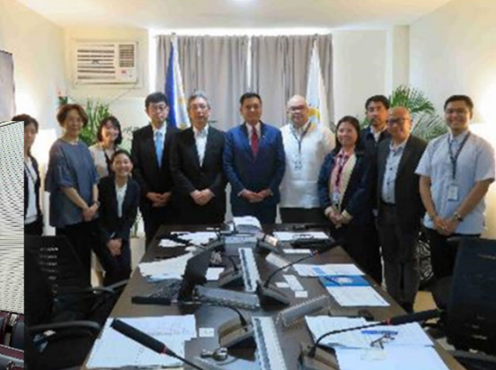
Philippine CCC (June, 2023)