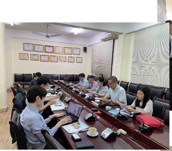
Viet Nam IMHEN (June, 2023)