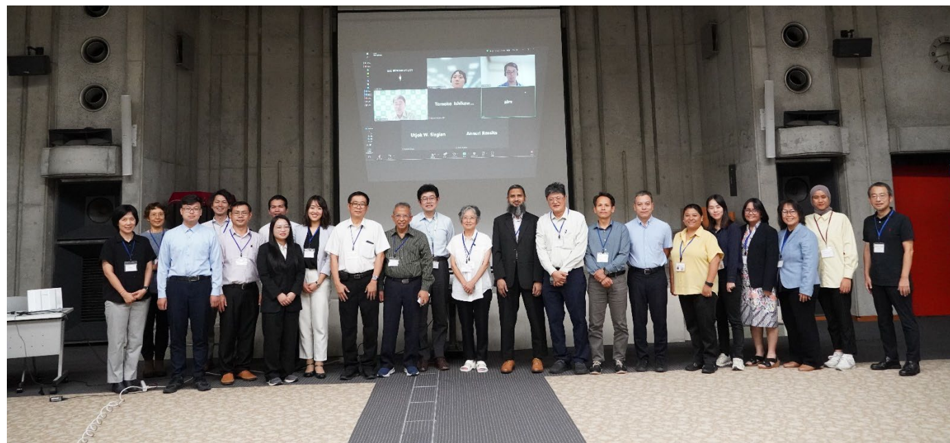
Photo: AIM/LoCARNet peer-to-peer knowledge sharing workshop in 2024

At the 24 July workshop, we hope to hear country updates and discuss future support needs!